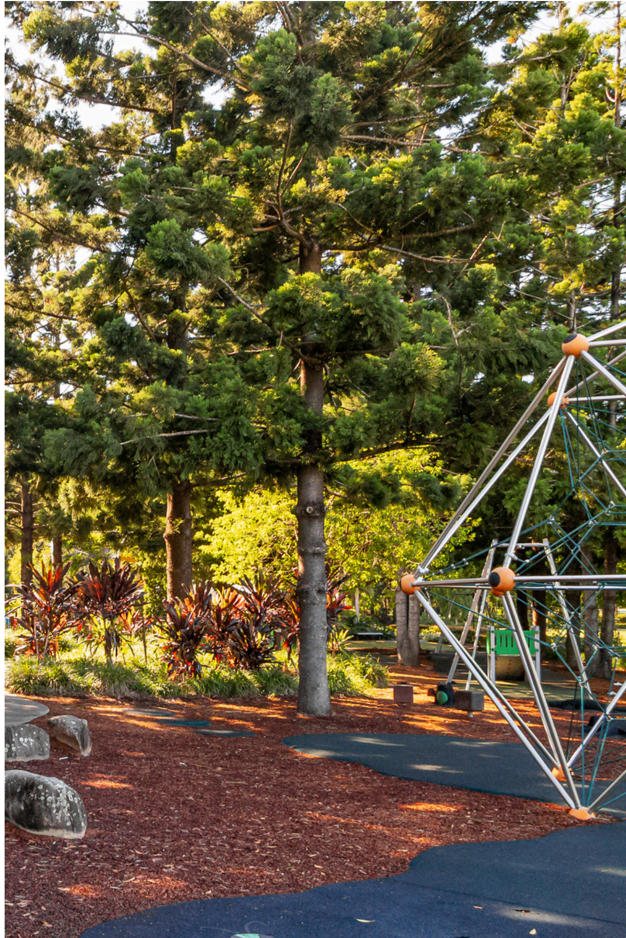
Pine Rivers Park