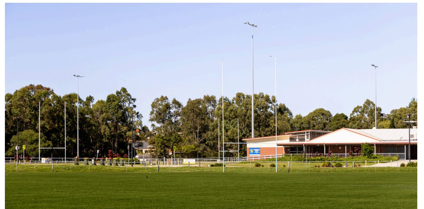
Les Hughes Sporting Complex

Bray Park is well equipped for an active lifestyle, with local parks, walking trails, and a variety of sporting facilities close by. North Pine Golf Club offers a relaxed 9-hole course, while the nearby South Pine Sports Complex supports a wide range of community sports.