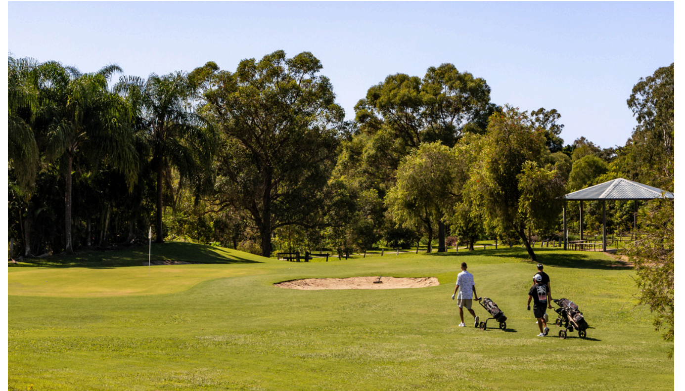
North Pine Golf Club

Bray Park is well equipped for an active lifestyle, with local parks, walking trails, and a variety of sporting facilities close by. North Pine Golf Club offers a relaxed 9-hole course, while the nearby South Pine Sports Complex supports a wide range of community sports.