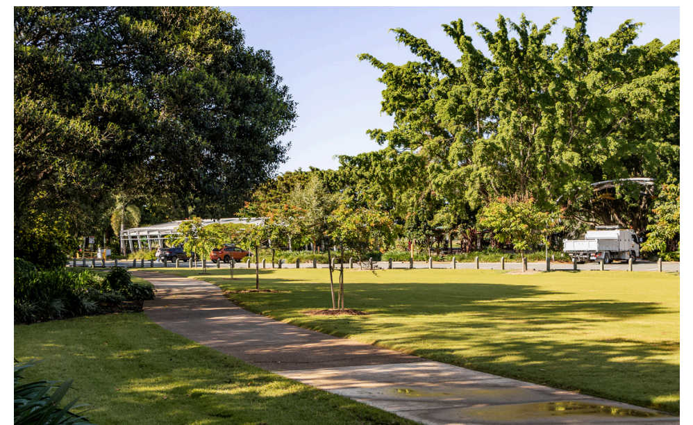
John Bray Park Durham Glade

From the expansive John Bray Park with its shade-rich playgrounds, sports courts, and wide open spaces, to the smaller green pockets like Allena, Durakai, Kumbhari, Odempa, Neilson, Oakley, and Wendy Allison Parks, the suburb is alive with opportunities to connect with nature.