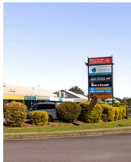
Bray Park Central

Bray Park is well-served by a variety of local retail hubs, making daily errands simple and convenient. Kensington Village and Bray Park Centre offer easy access to supermarkets, cafés, medical services, and essential retailers just moments from home. For a broader retail experience, Strathpine Centre is nearby with major brands, dining options, and entertainment, while Warner and North Lakes expand the offering even further. From everyday needs to weekend browsing, everything is within easy reach.