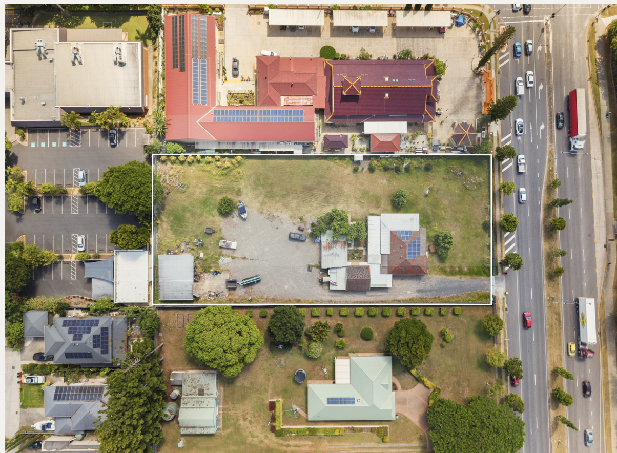
156 BLUNDER ROAD DURACK

Just a stone's throw from Oxley Golf Club, this boutique land release offers the ease of established suburban living with parks, schools, shops, and transport all close by. Set within a well-connected pocket of Durack, it's an opportunity to build a home designed for everyday comfort and long-term living.