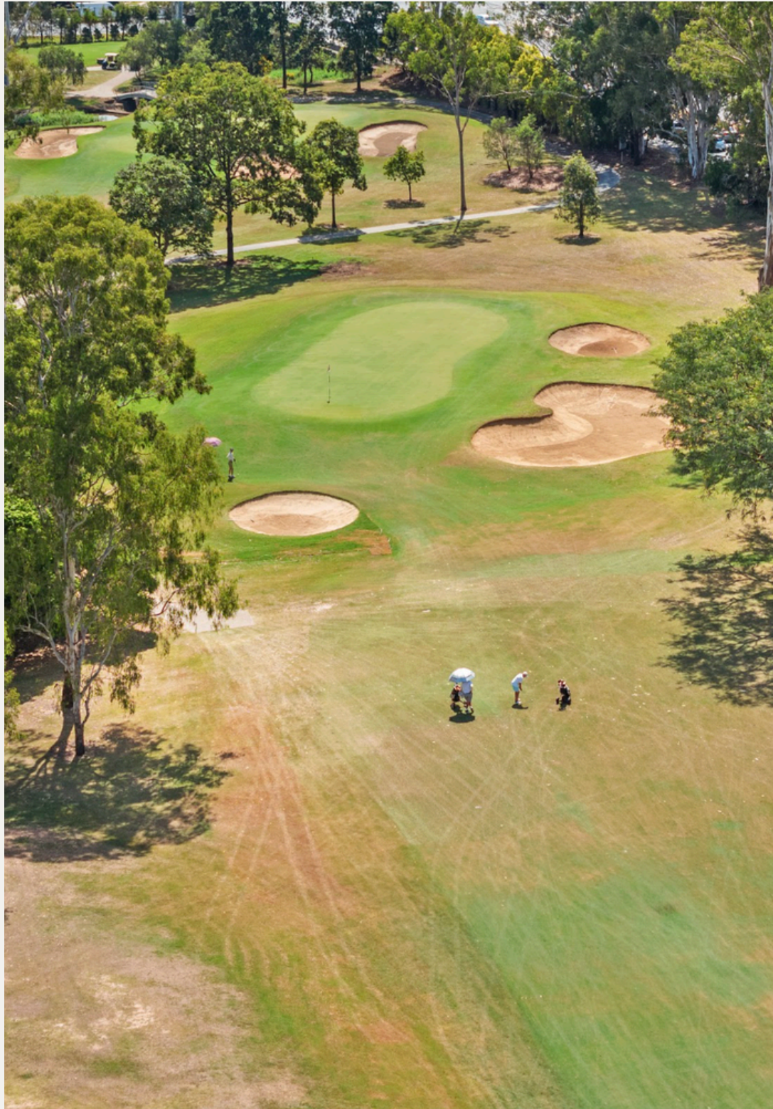
OXLEY GOLF CLUB