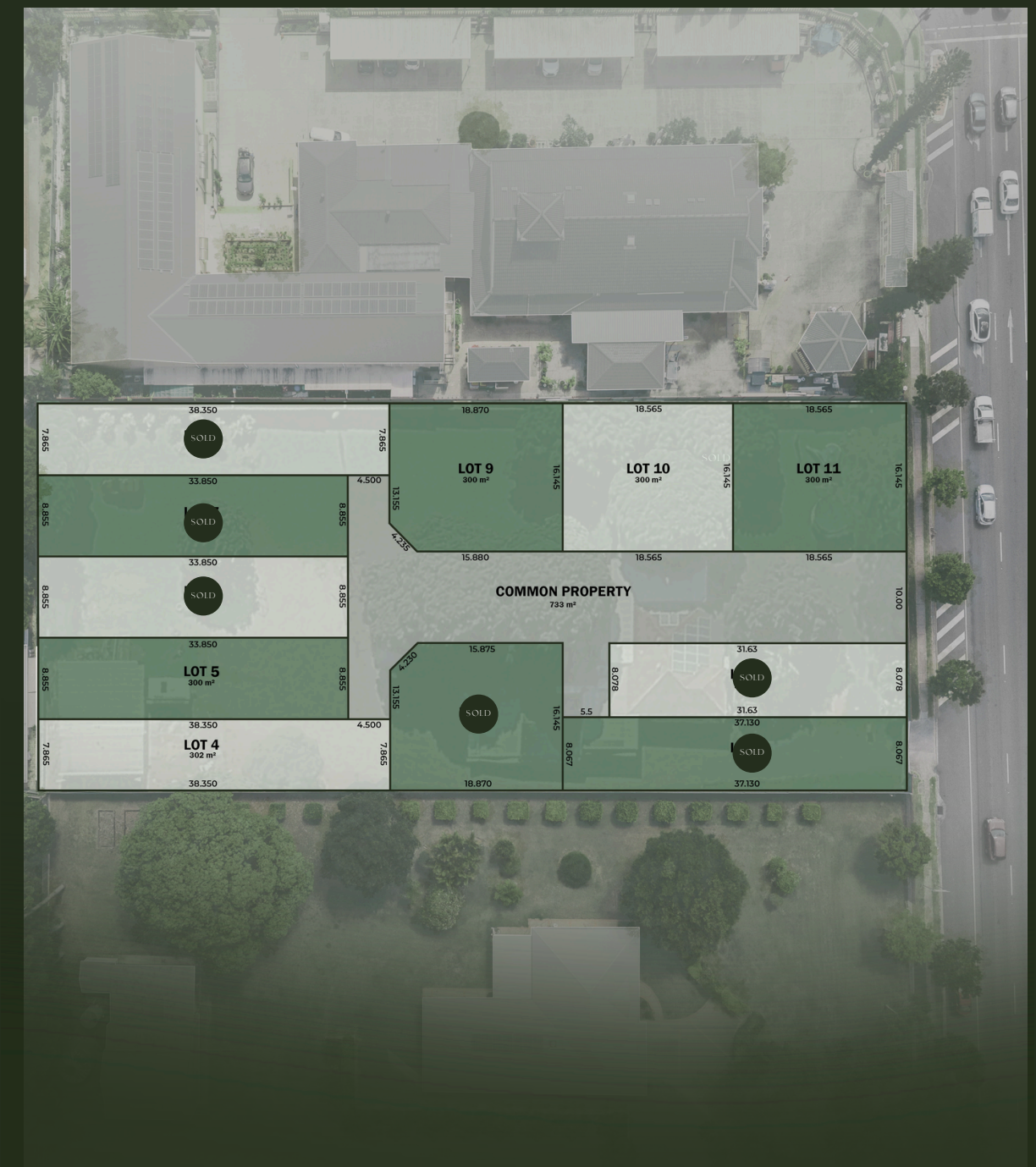
SITE PLAN — THE FAIRWAYS AT DURACK