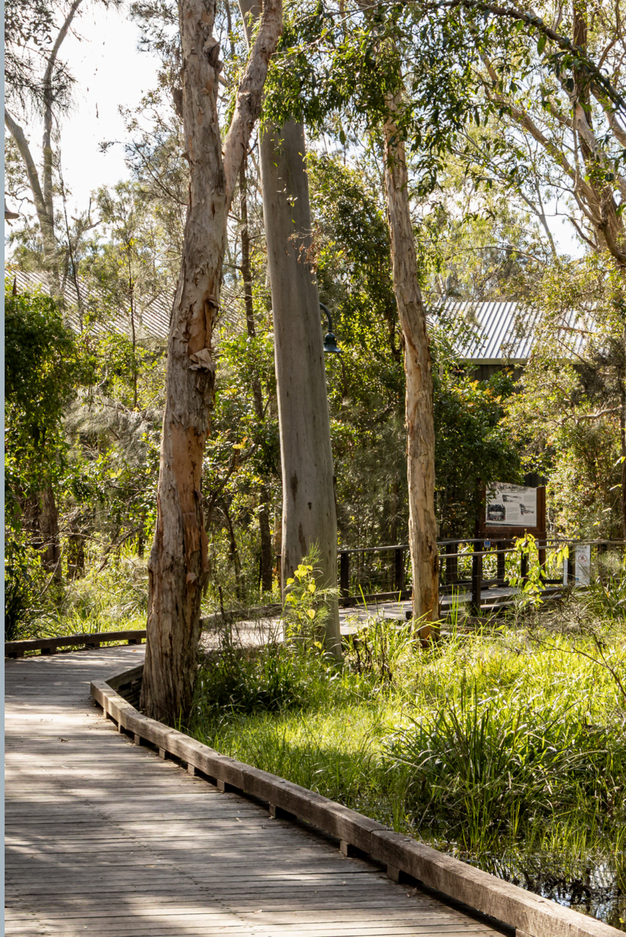
Boondall Wetlands Public Trail