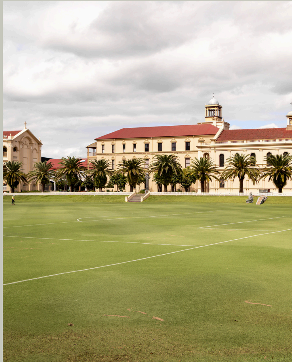
St Joseph's Nudgee College

Boondall is well set up for learning at every level. Families can choose from respected local options like Boondall State School and Sandgate District State High, or nearby independent schools including the renowned St Joseph's Nudgee College. Early learning centres and childcare providers are also close by, making the day-to-day easier for working families. Whether it's the school run, university commute, or first steps into learning, everything is within easy reach.