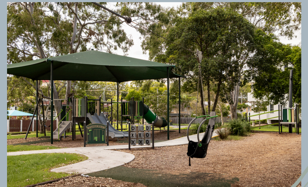
Frank Seeman Park Playground

Local walking tracks wind through established bushland and wetlands, offering quiet corners and open outlooks just minutes from home. The Boondall Wetlands are a favourite for locals — a place to slow down, spot native birdlife, or take the bike out for an easy loop. Nearby Nudgee Beach gives you access to the water without the weekend crowds, while quiet parks and playgrounds are scattered through the neighbourhood, ready for whatever the day calls for.