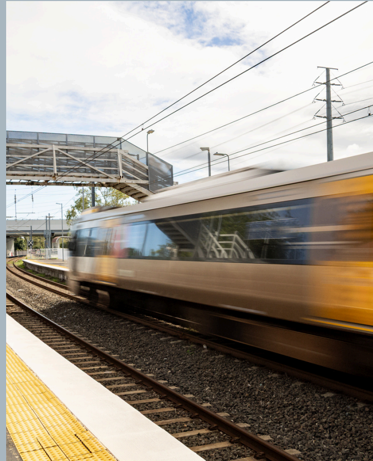
Boondall Train Station

Boondall strikes the perfect balance between convenience and calm. With two nearby train stations – Boondall and North Boondall – commuting to Brisbane CBD or the coast is effortless. Major roads like Sandgate Road and the Gateway Motorway put the airport, shopping precincts, and weekend getaways within easy reach. Whether you're heading to work or off on an adventure, The Grove keeps you close to everything that matters.