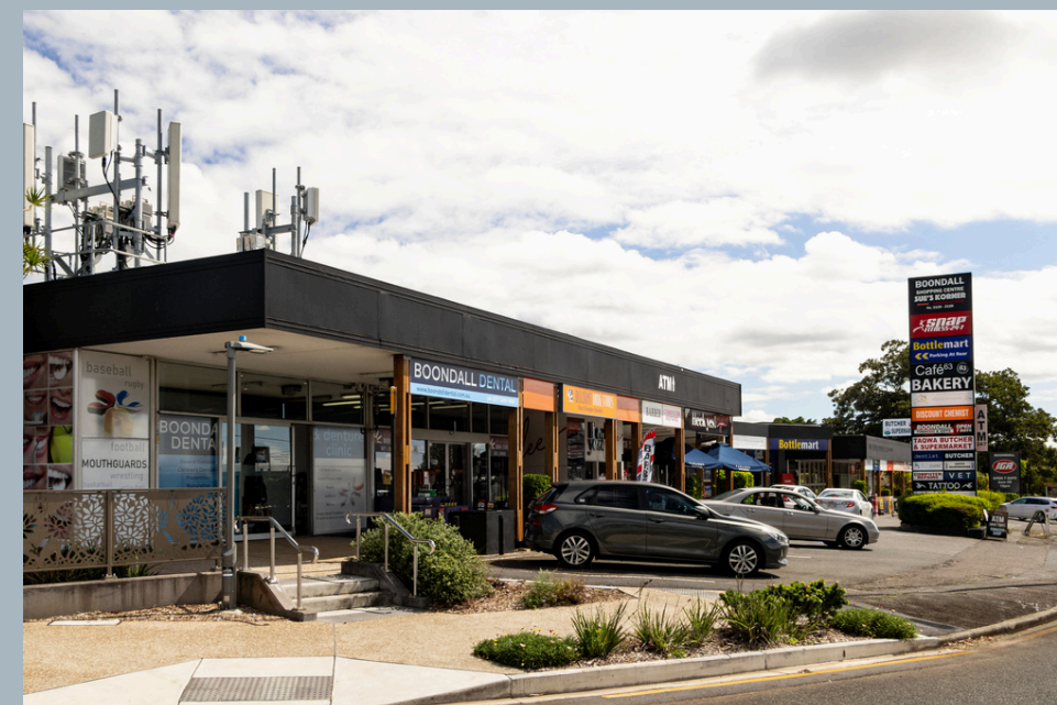
Boondall Shopping Centre

Boondall offers a variety of shopping options to cater to your daily needs and lifestyle. Just minutes from The Grove, Boondall Shopping Centre—affectionately known as Sue's Korner—features local favorites like Café 63, a bakery, a chemist, Snap Fitness, and Bottlemart, providing a convenient spot for essentials and casual dining. A short drive away, Taigum Square boasts over 50 specialty stores, including Woolworths, Big W, Best & Less, and various eateries, making it a one-stop destination for shopping and services. For a more extensive retail experience, Westfield Chermiside, one of Brisbane's largest shopping centers, is located approximately 6 km from Boondall, offering a wide range of major retailers and dining options.