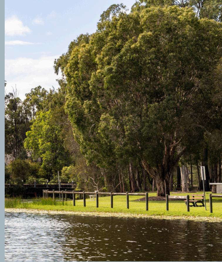
Boondall Dog Park

Local walking tracks wind through established bushland and wetlands, offering quiet corners and open outlooks just minutes from home. The Boondall Wetlands are a favourite for locals — a place to slow down, spot native birdlife, or take the bike out for an easy loop. Nearby Nudgee Beach gives you access to the water without the weekend crowds, while quiet parks and playgrounds are scattered through the neighbourhood, ready for whatever the day calls for.